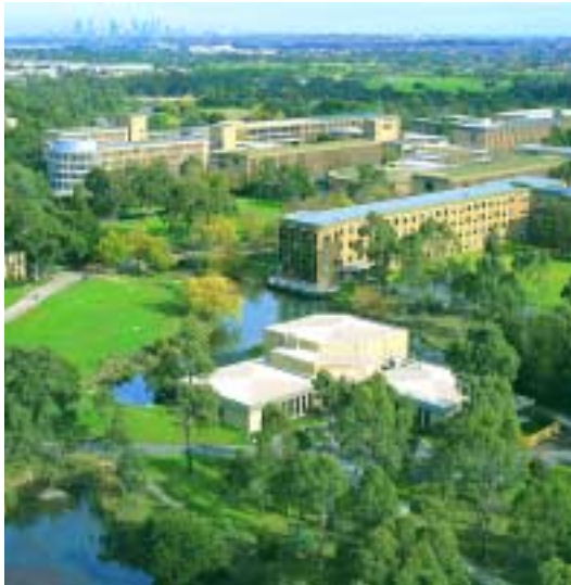
Melbourne, (Bundoora) campus