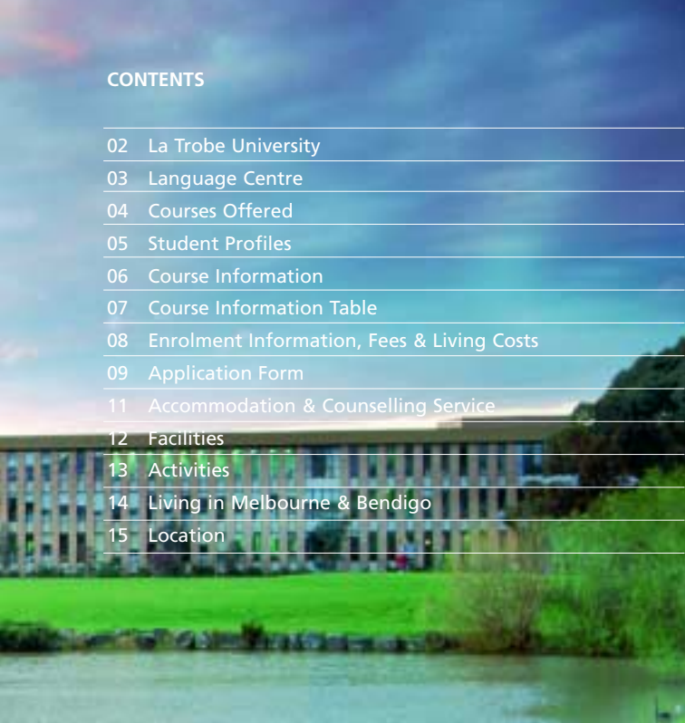
David Myers Building