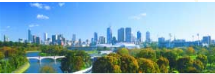
Melbourne Central Business District, Victoria