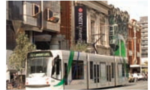
RMIT City campus

www.rmit.edu.au/international/educationabroad