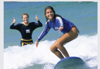
Noosa - Highest quality tuition, sun, sand and surf!