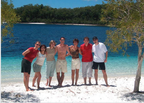
Students enjoying the world-class beaches