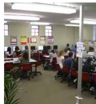
Study centre / library