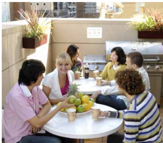
The student café balcony

A Kaplan International Colleges representative meets our students at the airport and transports them directly to their accommodation. After exiting from Australian customs proceed to the arrivals area and look out for the Kaplan International Colleges Representative standing near the hire car information desks at the back of the arrivals hall. The Kaplan International Colleges Representative will hold a sign with the name of the student and the Kaplan International Colleges logo. If there are any problems locating the Kaplan International Colleges Representative please call the phone number of the Kaplan International Colleges Transfer Service provided on the confirmation letter and proceed to McDonalds for a specific meeting point. If necessary you can also call the Kaplan International Colleges Emergency phone number that is also located on the confirmation letter. Tel: +61 414 605 593 (Transfer Company) or +61 425 320 801 (college Emergency Mobile)