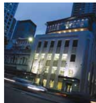
Kaplan International College Sydney City