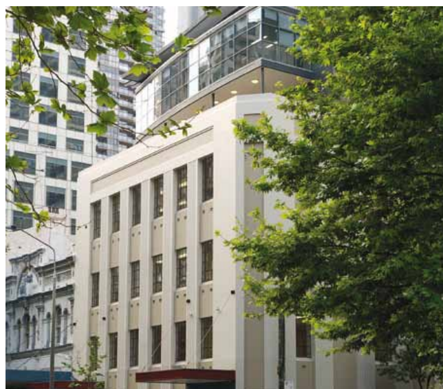
Kaplan International College Sydney City

For the perfect mix of stunning surroundings, offering beach life, a thriving cultural scene and the excitement of a vibrant metropolis - Sydney is the city to be in. At the end of a day of classes, sit back and drink a cappuccino at a harbour front café and when the weekend arrives, head for Bondi where 'Sydneysiders' soak up the sun and enjoy world-class surfing.